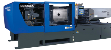
Ultra-High-Speed SE-EV-HP 56 to 202 U.S. tons