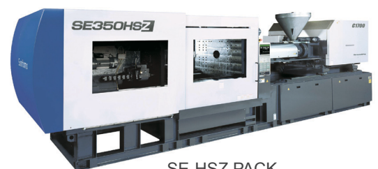
SE-HSZ PACK 308 to 385 U.S. tons