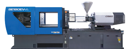
SEEV-A 56 to 202 U.S. tons