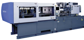
2-Shot SE75D-CI 83 U.S. tons