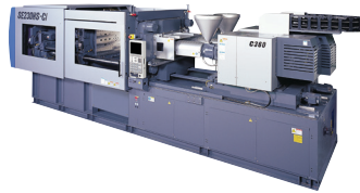
2-Shot SE-HS-CI 253 to 308 U.S. tons