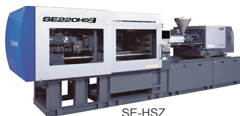
SE-HSZ 242 to 385 U.S. tons