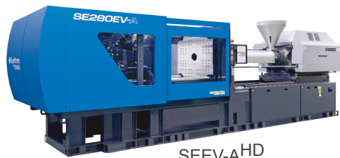
SEEV-AHD 247 to 562 U.S. tons