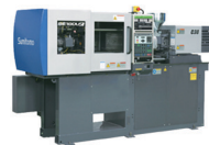
SE-DUZ 20 to 33 U.S. tons