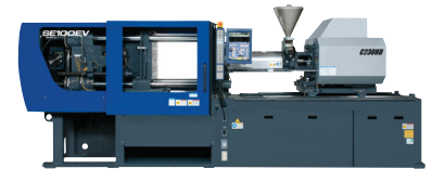
SE-EV-HD 112 to 202 U.S. tons